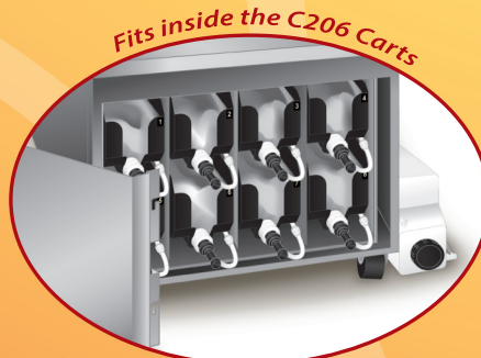
Fits inside the C206 Carts