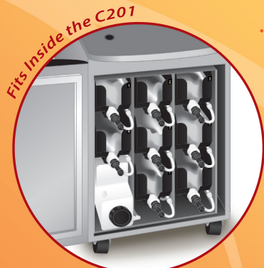
Fits inside the C201