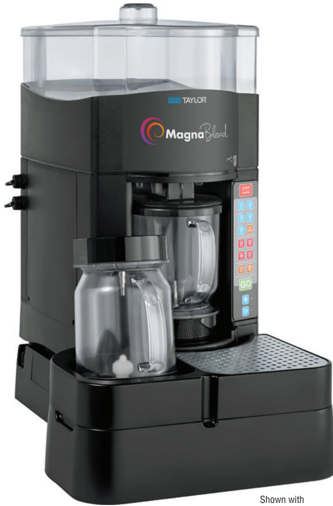
Shown with standard ice hopper