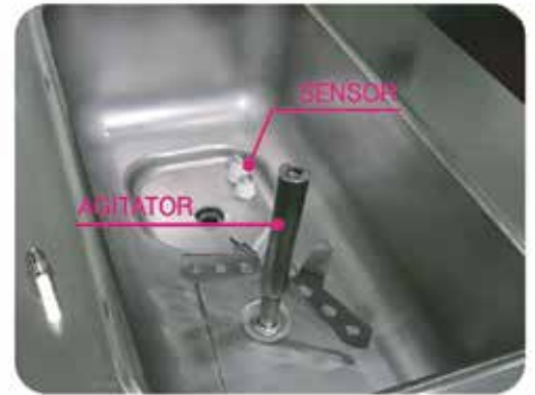
Agitator Mix out & mix low sensors