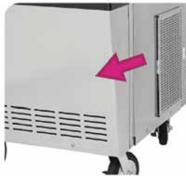
Removable & Washable Air Filter