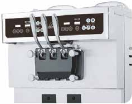
Easy to access control system on the front LCD touch panel