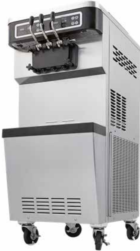
ISI-303SNA / SNAP ISI-303SNW / SNWP